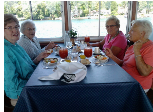
Ladies enjoying a relaxing day trip on Lake Geneva