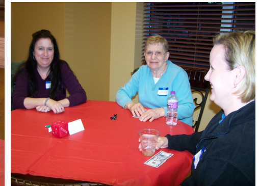
Bunco Night at Creekside Place-3rd Wednesday of the Month